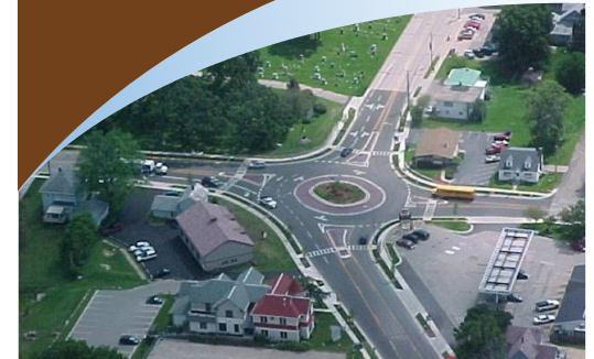
Roundabout in Mt. Horeb, WI