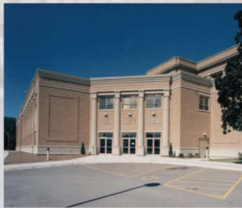
East and West High Schools