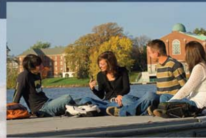
St. Norbert College