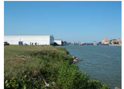
View looking north along Fox River